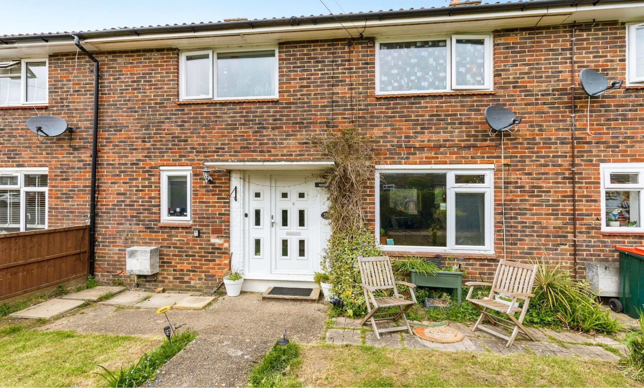
Spring Plat, Crawley RH10 7DE