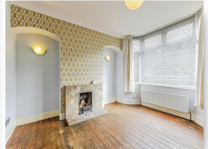
Highfield Road, Northampton NN1 4SR