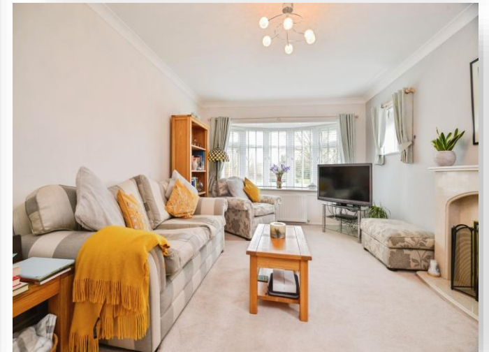
Lawrence Road,Thornaby Stockton-On-Tees TS17 8QF