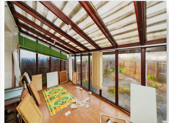
Smilie Avenue, Wirral, CH46 6BL