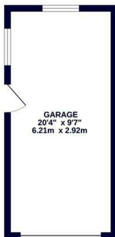
OUTBUILDING 195 sq.ft. (18.1 sq.m.) approx.