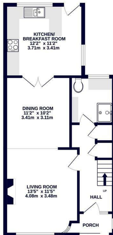
GROUND FLOOR 547 sq.ft. (50.9 sq.m.) approx.