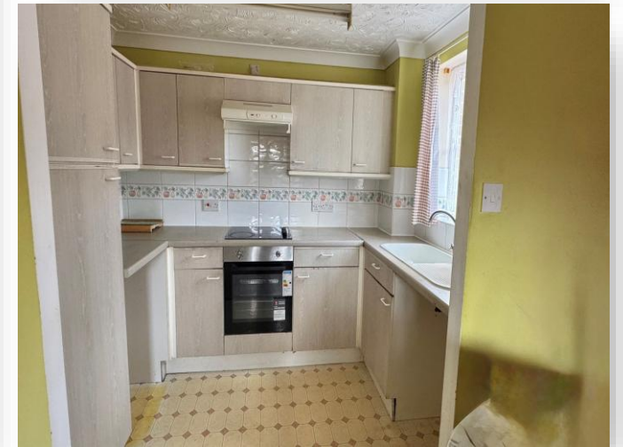
Bader Close, King's Lynn, PE30 4GA