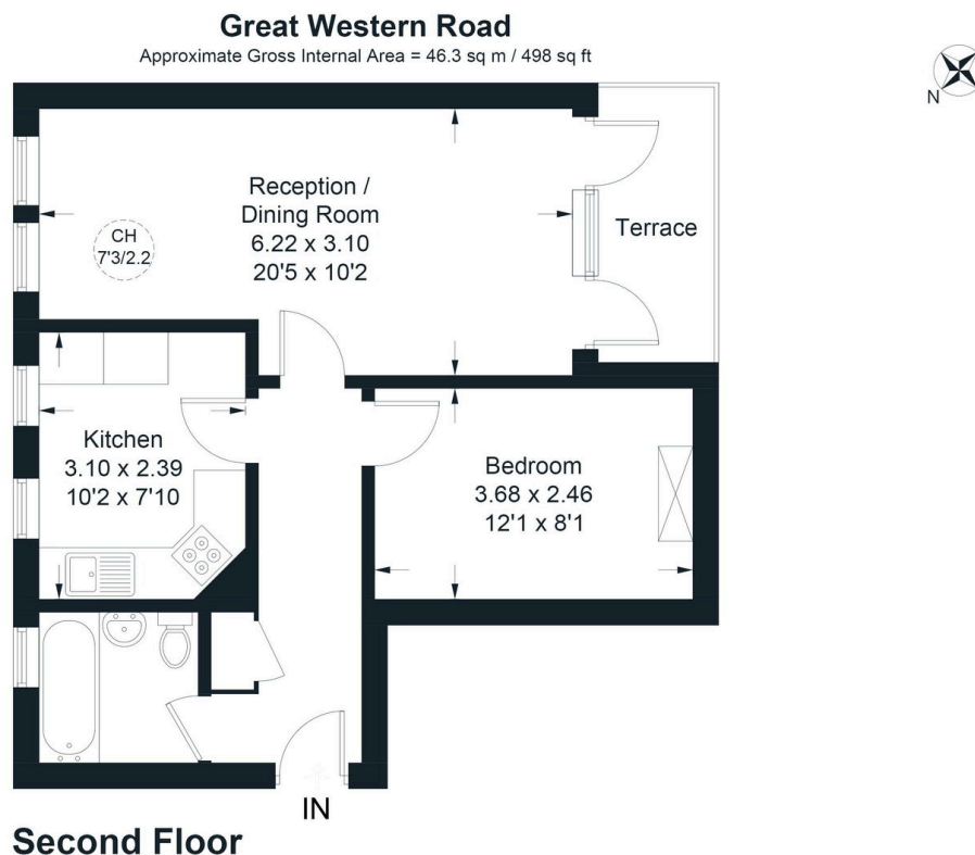
Illustration for identification purposes only, not for valuation purposes, measurements are approximate, not to scale.

Situated on the second floor of an attractive purpose build, this beautifully presented one-bedroom apartment offers approximately 498 sq ft of bright and well-proportioned accommodation, complete with a private west-facing terrace. The spacious reception room is flooded with natural light and opens onto the terrace, creating the perfect space to relax or entertain. A separate kitchen provides excellent storage and workspace, while the generous double bedroom and contemporary bathroom complete the accommodation.