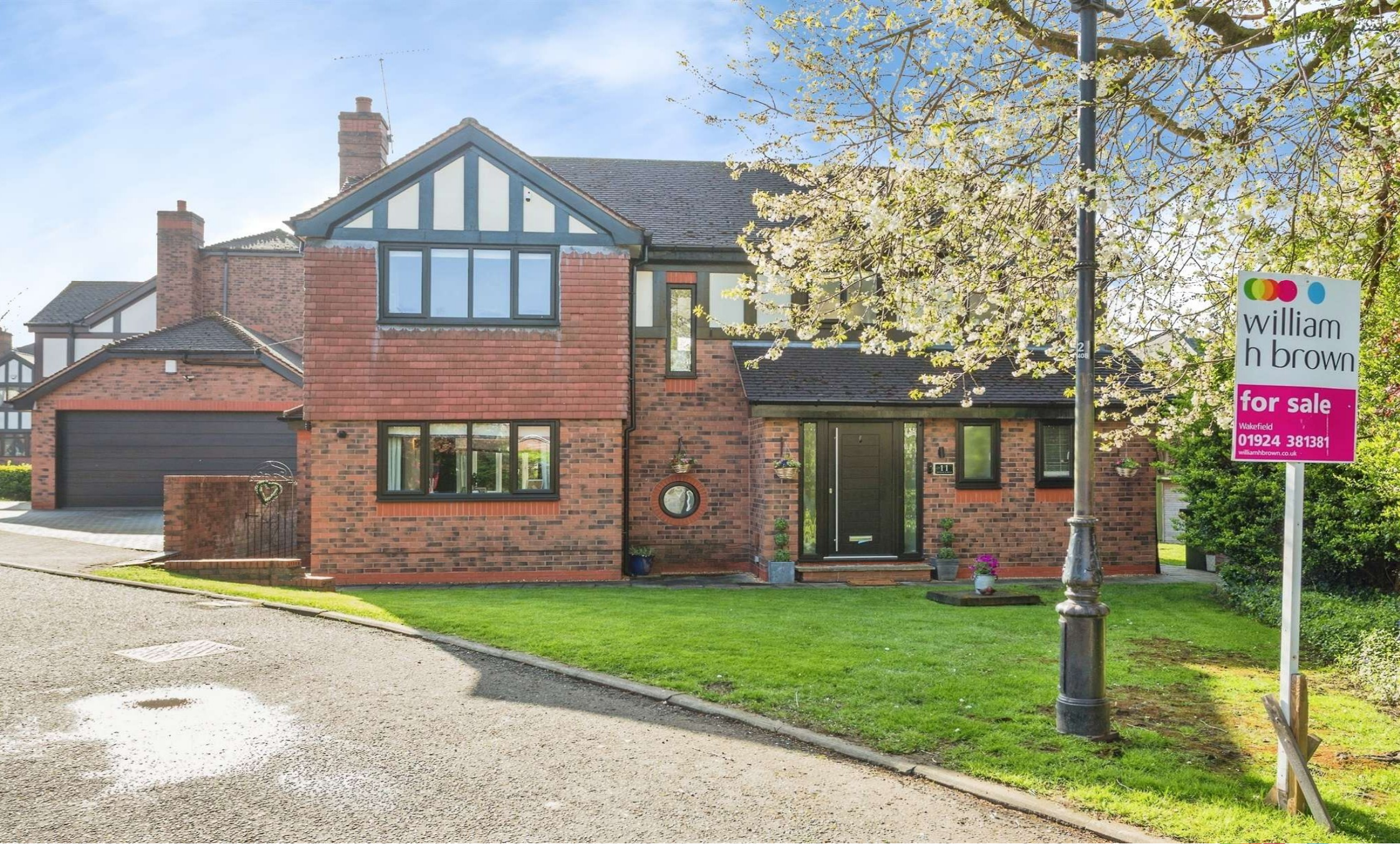
Tudor Lawns, Carr Gate Wakefield WF2 0UU