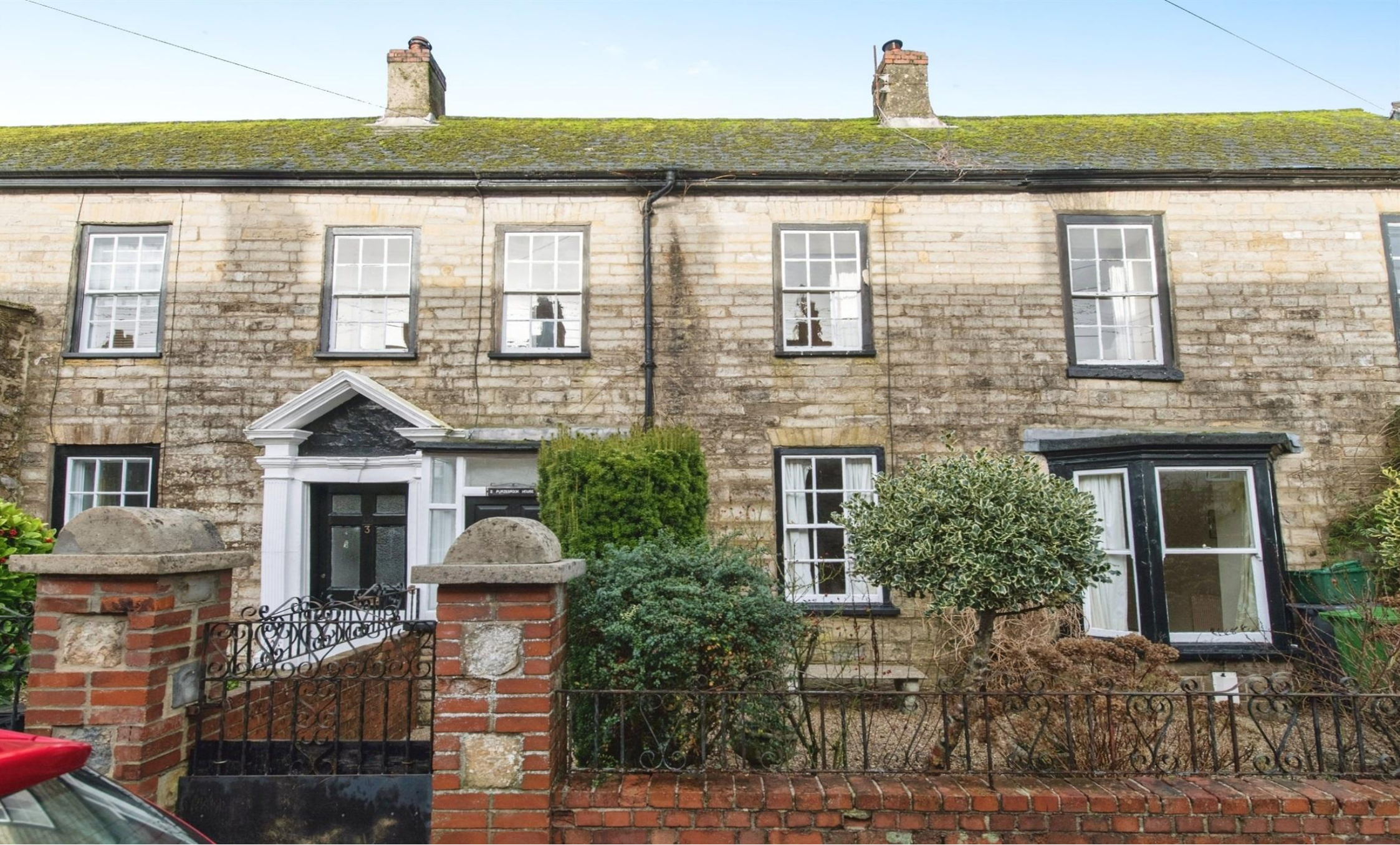
Purzebrook House, Musbury Road, Axminster EX13 5JG