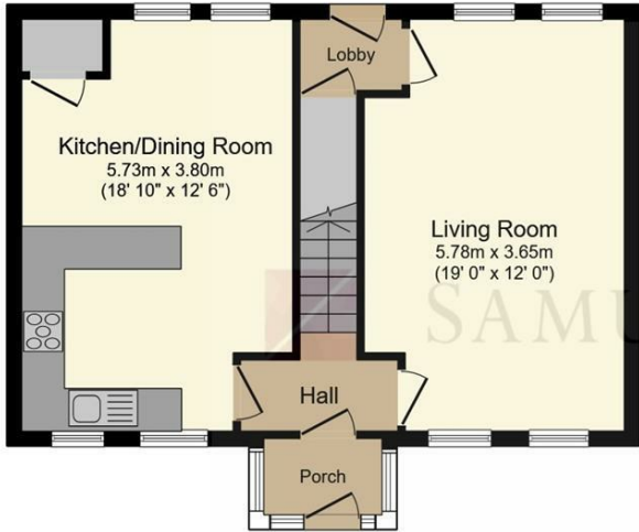
Ground Floor Floor area 50.8 m 2 (547 sq.ft.)