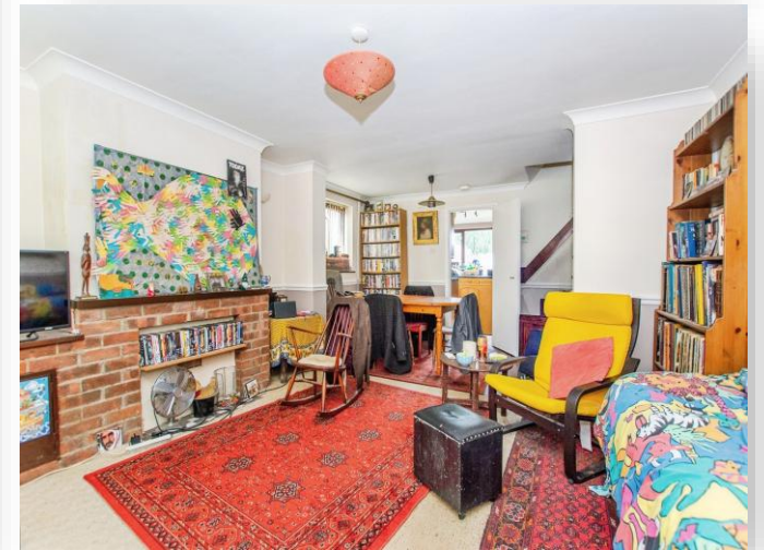
Old Lynn Road, WISBECH, PE13 3SB