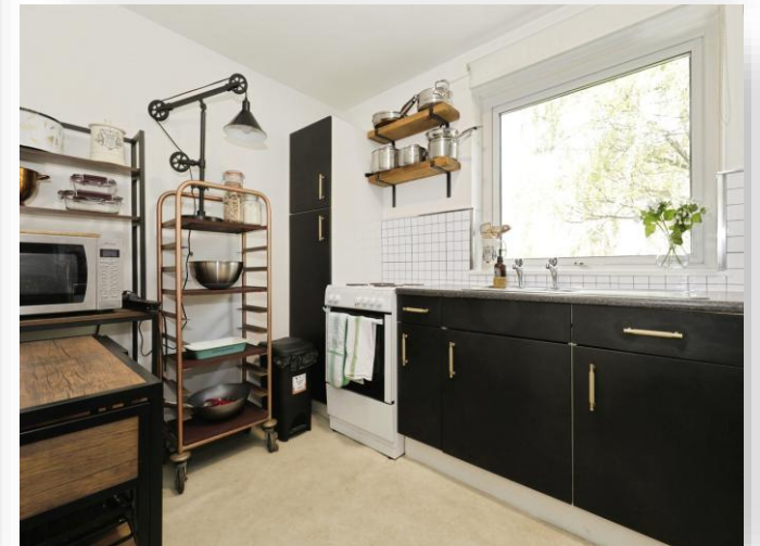
Hampsthwaite Road, Harrogate HG1 2DU