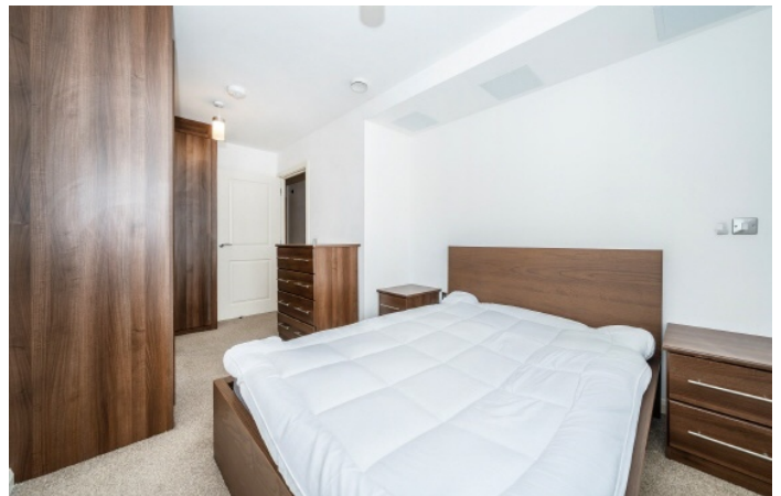
Newport Avenue, E14