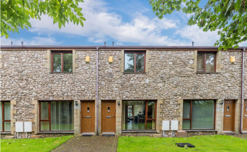
11 Lapwing House