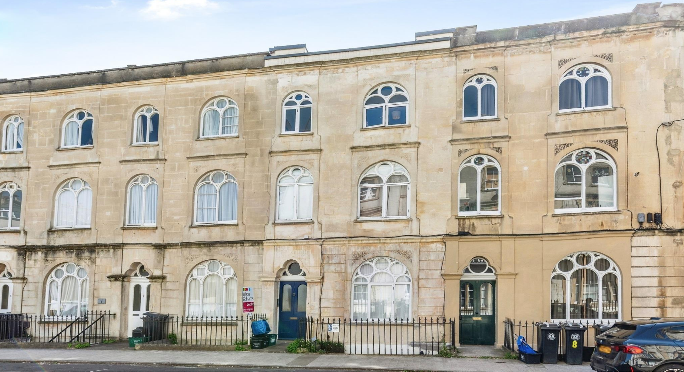
Top Floor Flat Dover Place, Clifton Bristol BS8 1AL