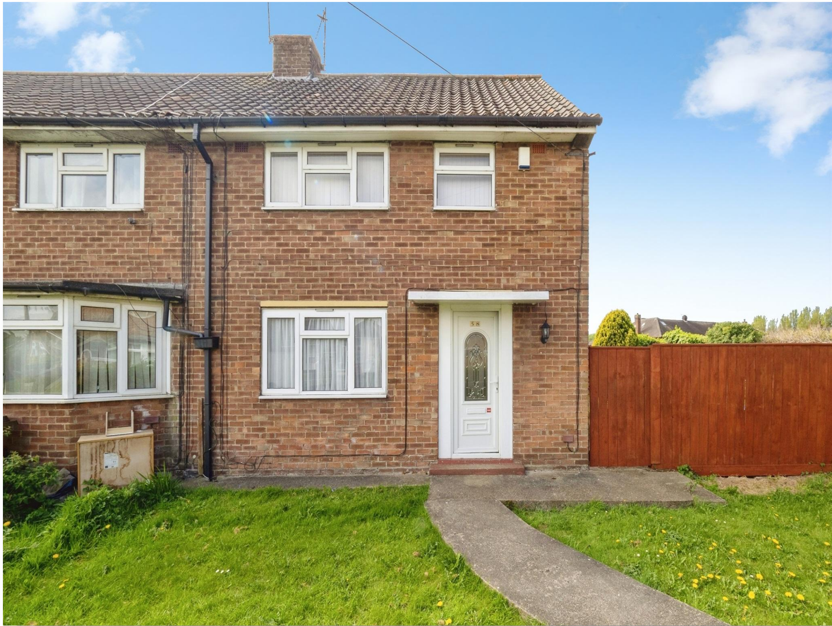
Larne Road, Hull, HU9 4UE