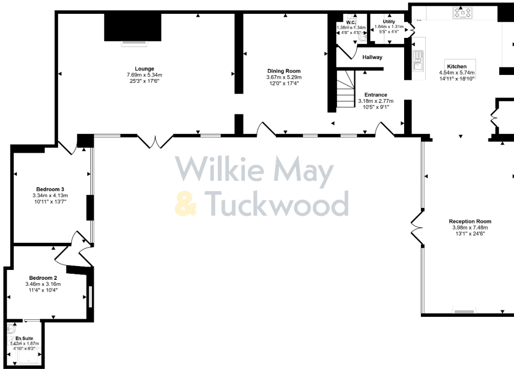
Ground Floor Approx 166 sq m / 1788 sq ft