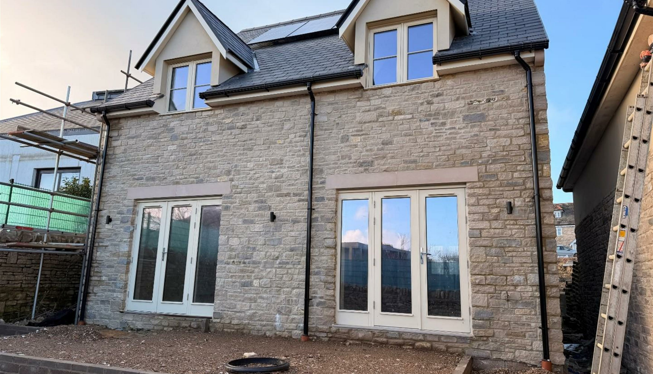
Ansty House, Old Malthouse, High Street Langton Matravers | Dorset | BH19 3HA