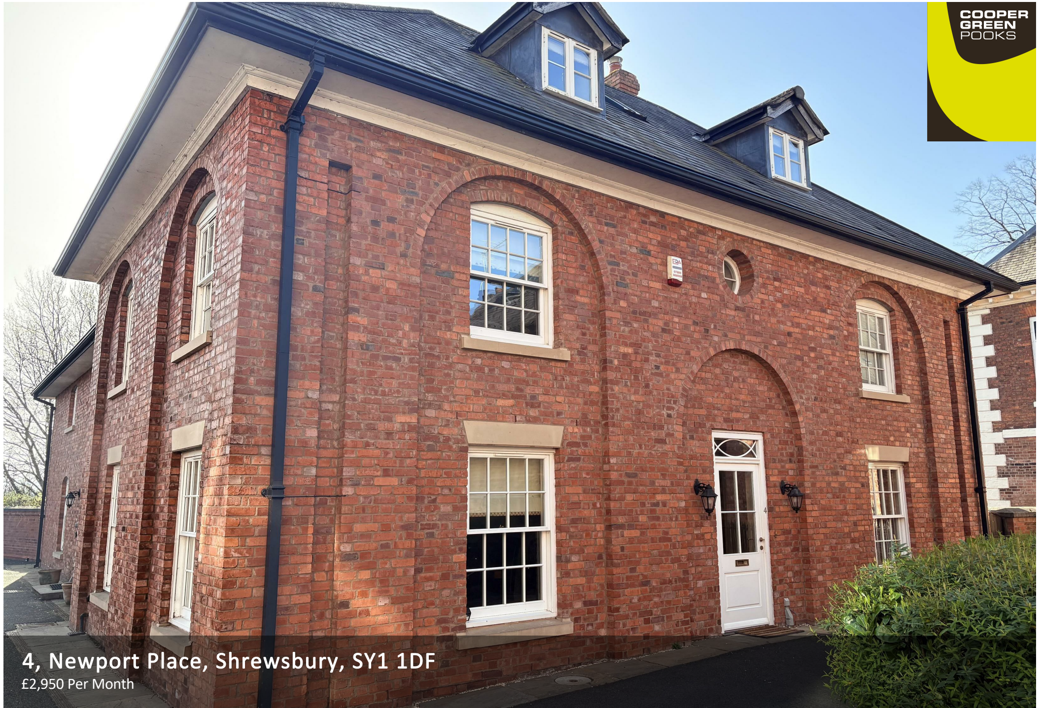
4, Newport Place, Shrewsbury, SY1 1DF £2,950 Per Month