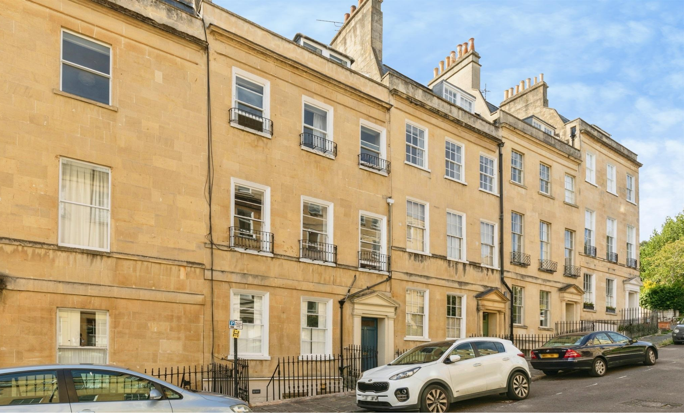
Flat 3 Great Bedford Street, Bath BA1 2TZ