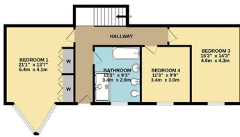
LOWER GROUND 768 sq.ft. (71.4 sq.m.) approx.