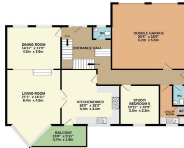
GROUND FLOOR 1,480 sq.ft. (137.5 sq.m.) approx.