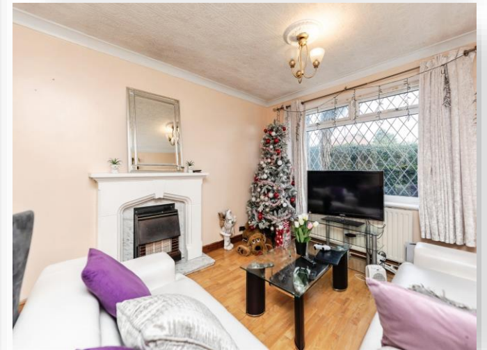
Nesfield View, Leeds LS10 3LA