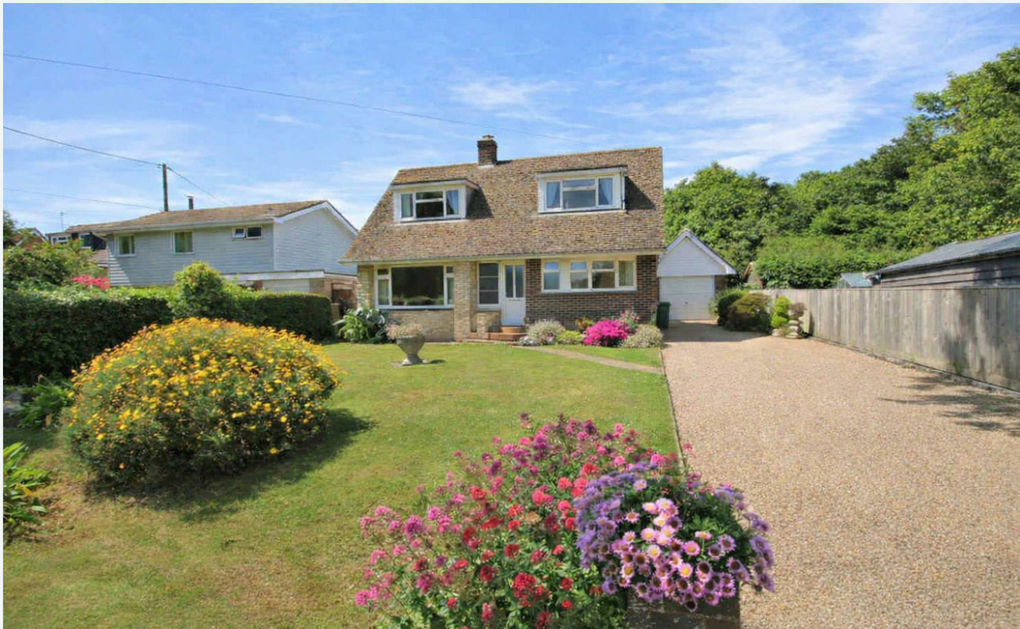
Hanago, Norton Green, Isle of Wight