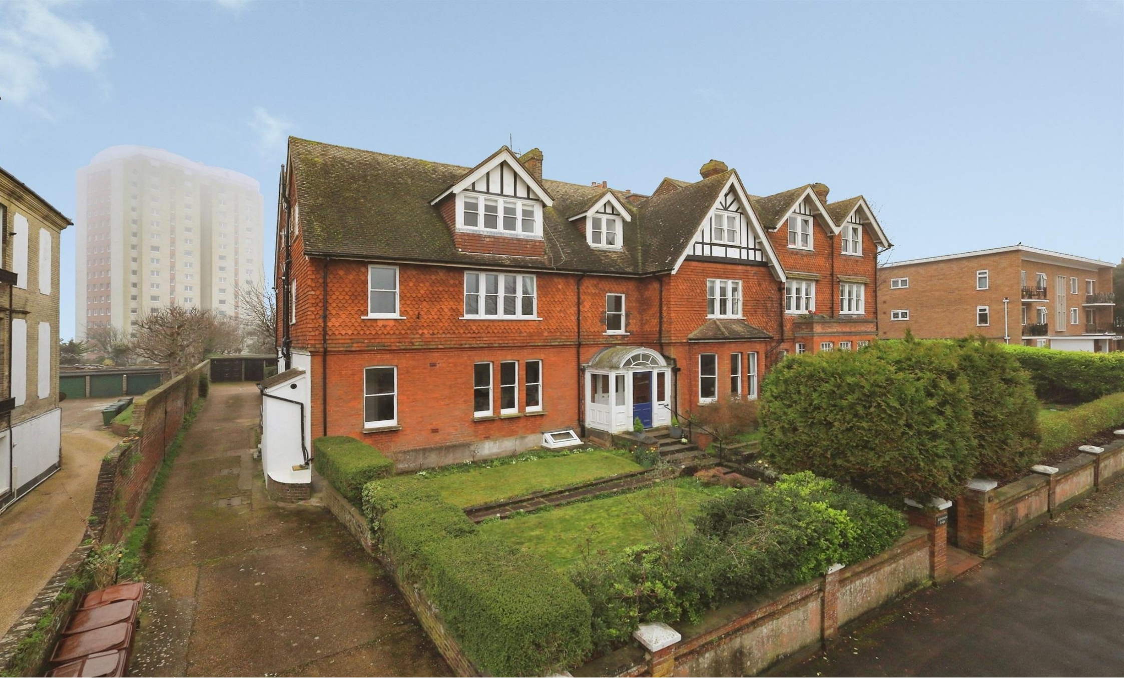
Edenthorpe Lodge St. Johns Road, Eastbourne BN20 7JA