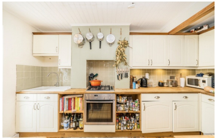
Brightfield Road, SE12