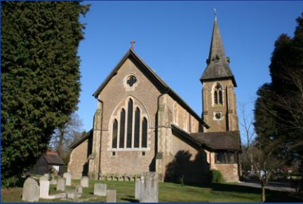
St Lukes Church Grayshott

For identification only No 5 shown to the left of no 6 being far right of the highlighted area.