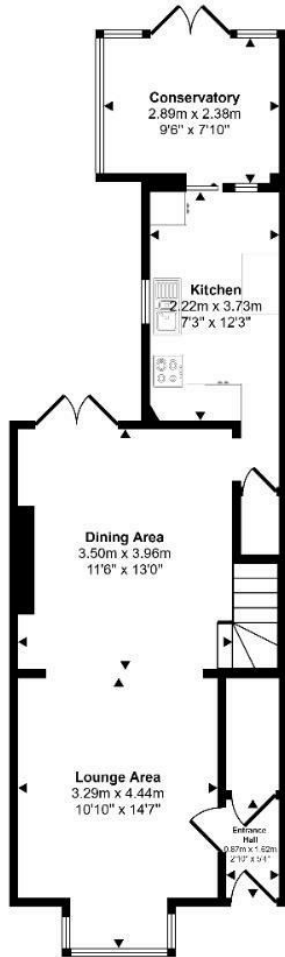
Ground Floor Approx 50 sq m / 537 sq ft