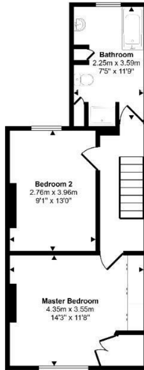
First Floor Approx 42 sq m / 451 sq ft