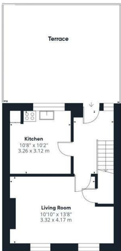
First Floor (Maisonette)