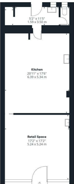
Ground Floor (Shop)