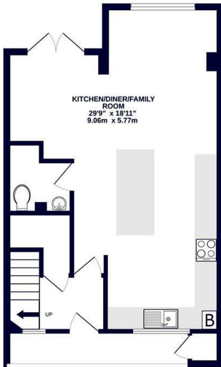
GROUND FLOOR 535 sq.ft. (49.7 sq.m.) approx.