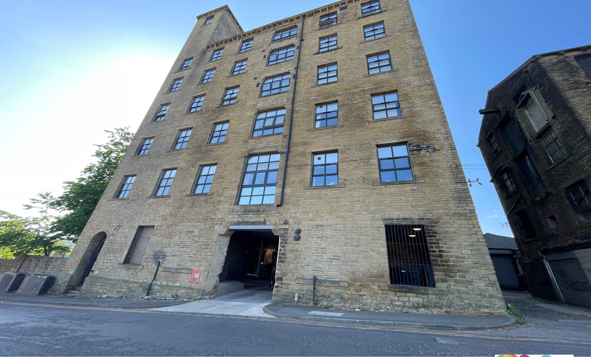
Martins Mill, Pellon Lane, Halifax, HX1 5QJ