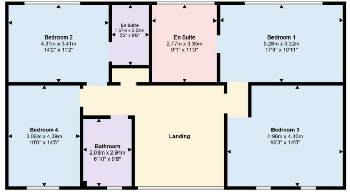
First Floor Approx 114 sq m / 1223 sq ft

This floorplan is only for illustrative purposes and is not to scale. Measurements of rooms, doors, windows, and any items are approximate and no responsibility is taken for any error, omission or mis-statement. Icons of items such as bathroom suites are representations only and may not look like the real items. Made with Made Snappy 360.