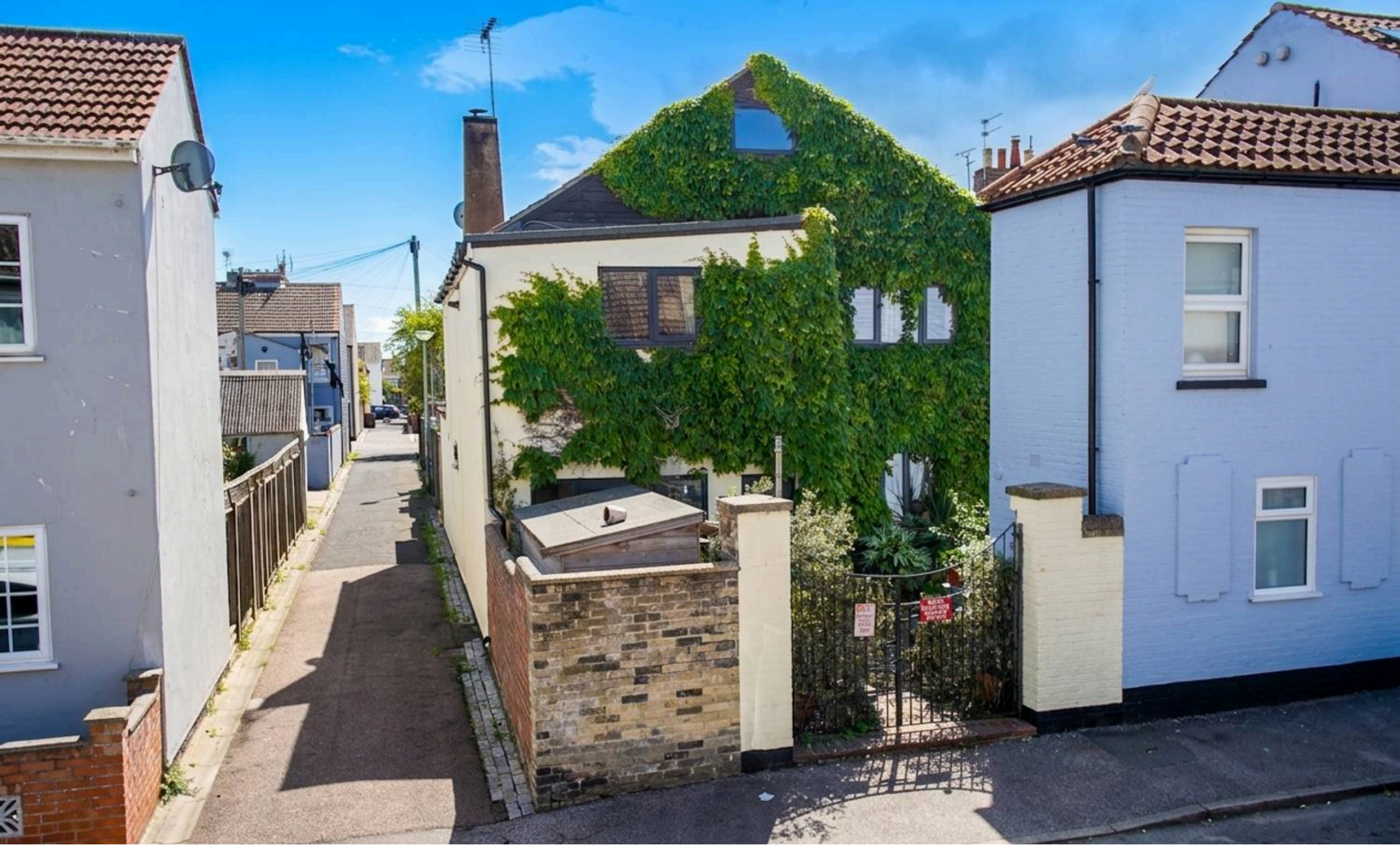
Sandringham Road, Lowestoft - NR32 2BU