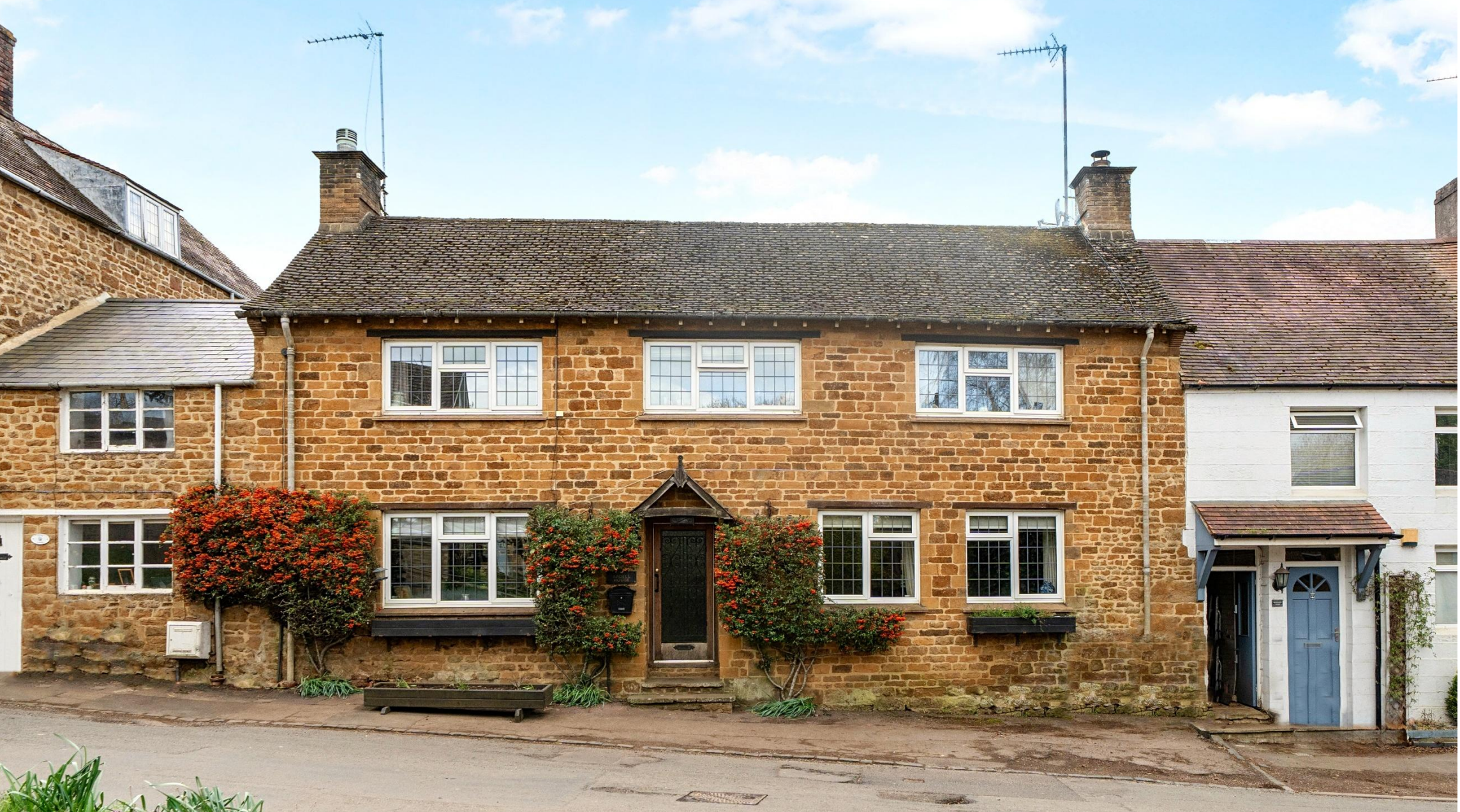
Ardell House, Cumberford Hill Bloxham, Banbury, OX15 4HL