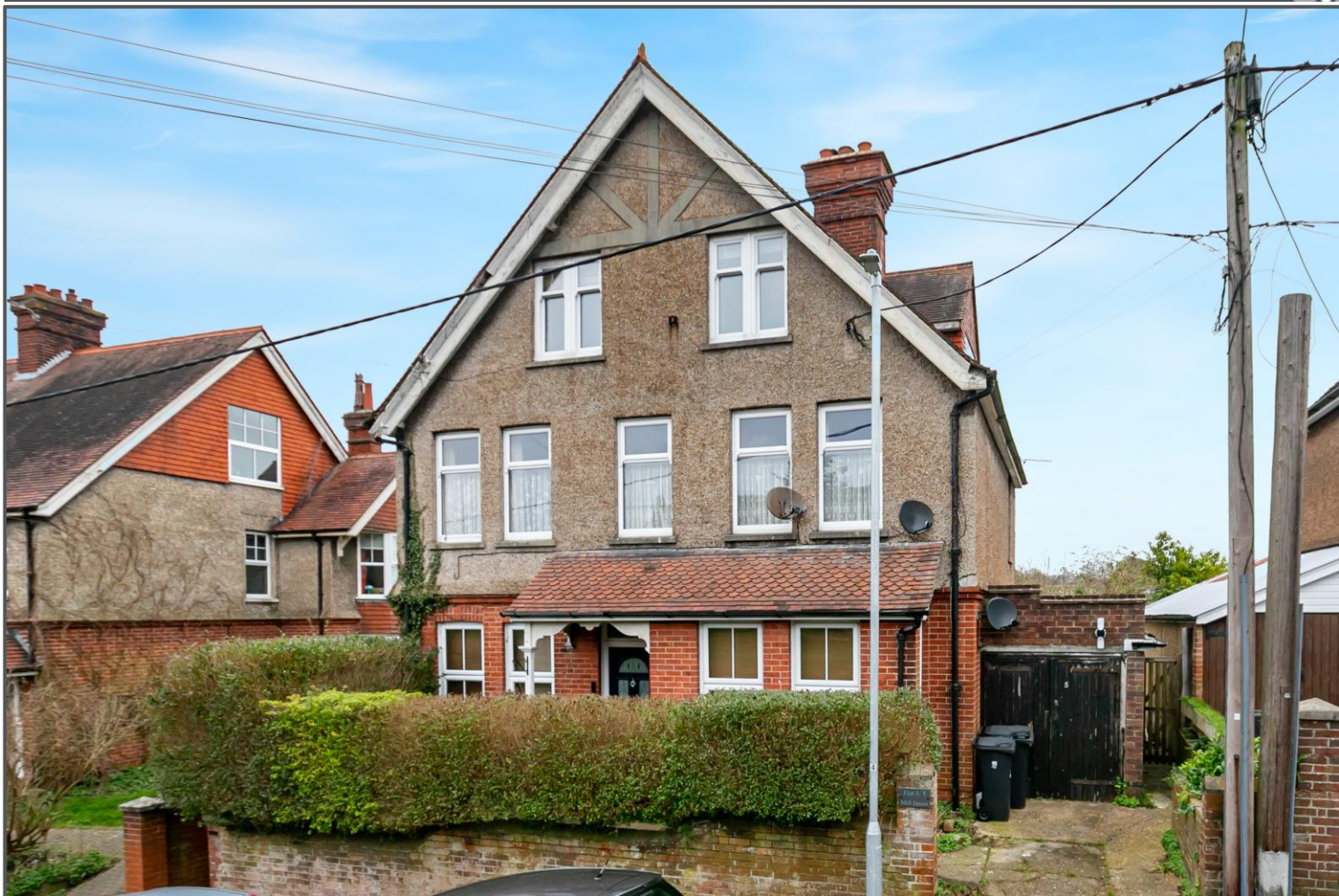
Mill Drove, Uckfield, TN22 5AB