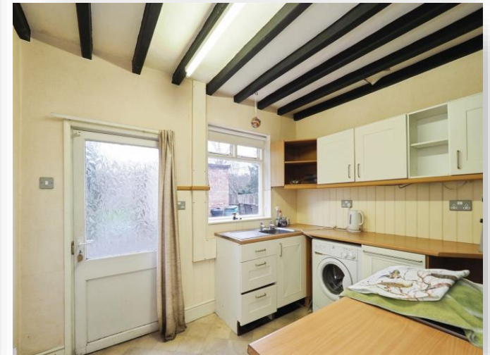
Rothley Road, Mountsorrel