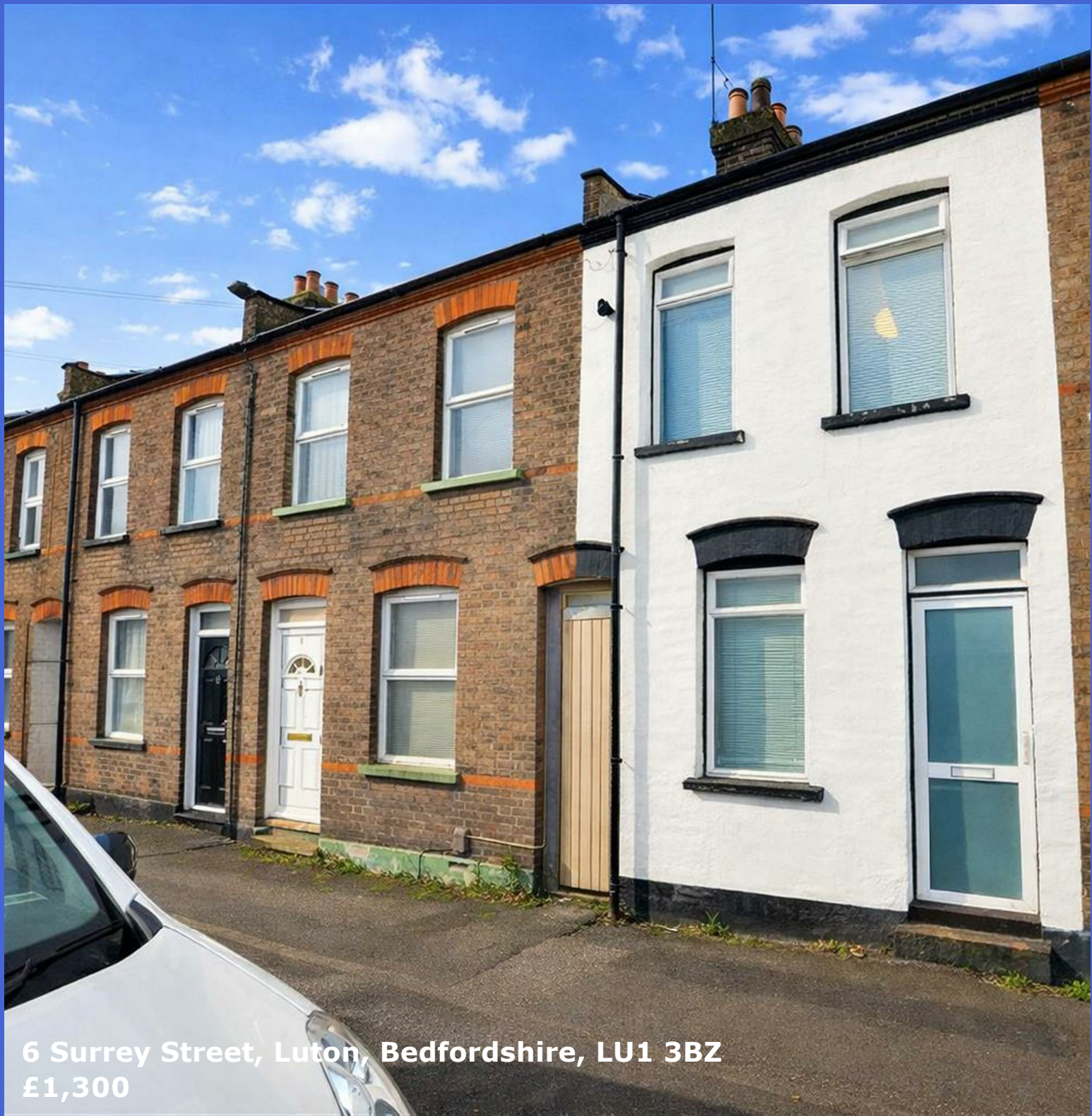
6 Surrey Street, Luton, Bedfordshire, LU1 3BZ £1,300