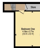
Flat Two Basement