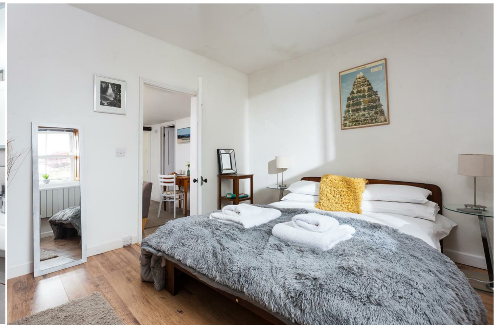
Fore Street, St. Erth, Hayle, TR27 6HT