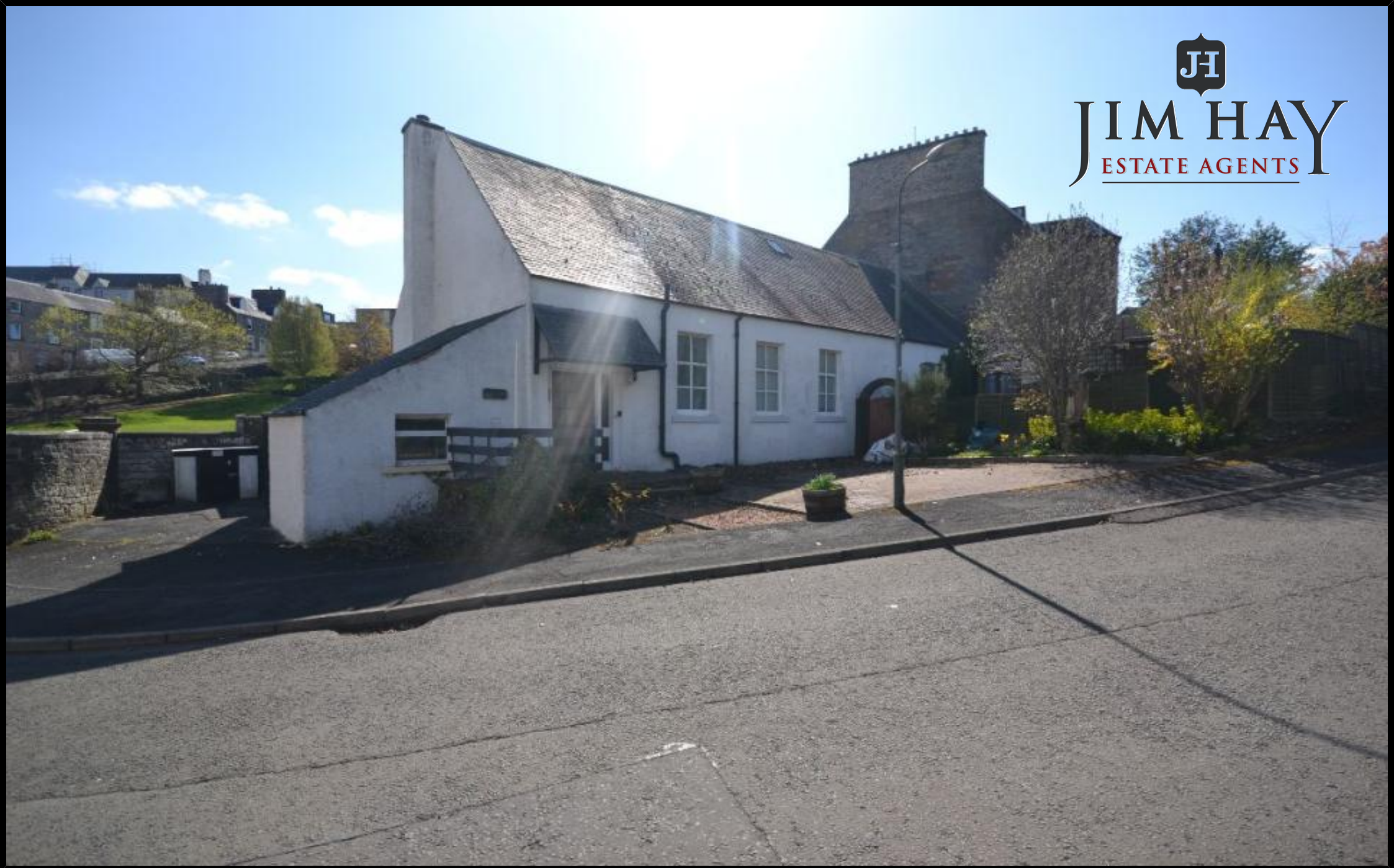
Greenall Cottage St Margarets Drive Hawick TD9 0JE