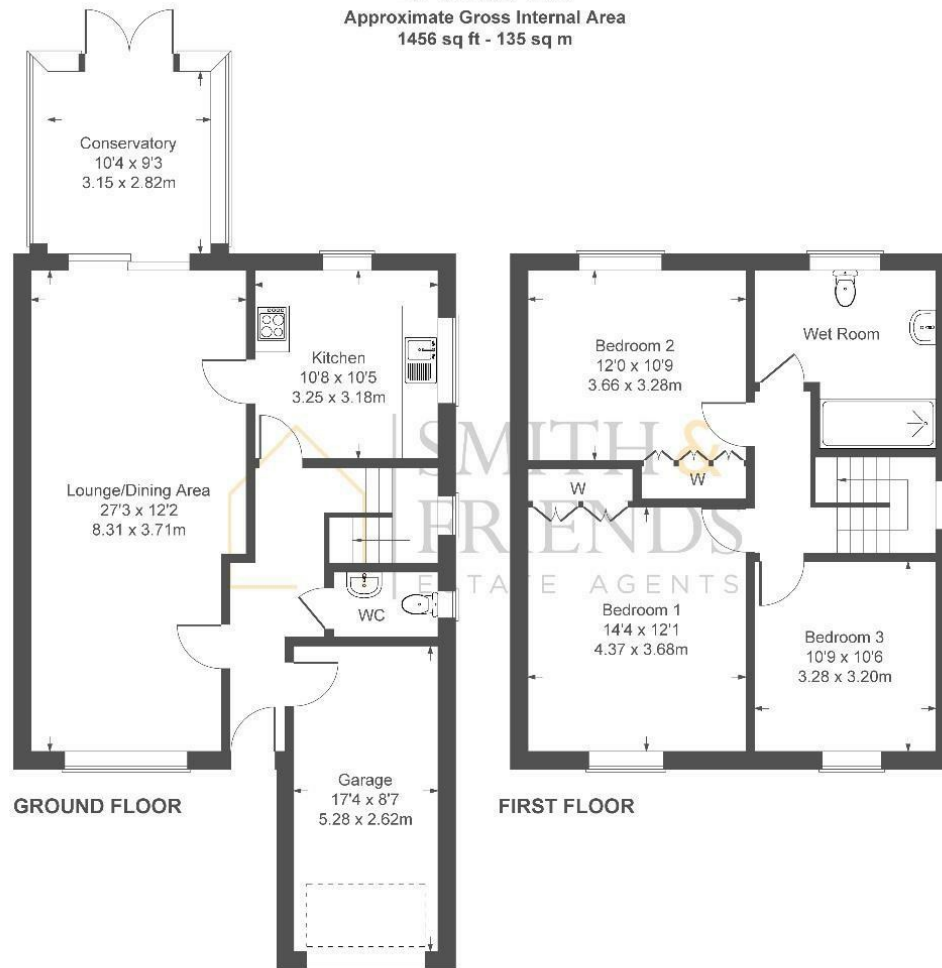
Not to Scale. Produced by The Plan Portal 2026 For Illustrative Purposes Only.

Approximate Gross Internal Area 1456 sq ft - 135 sq m