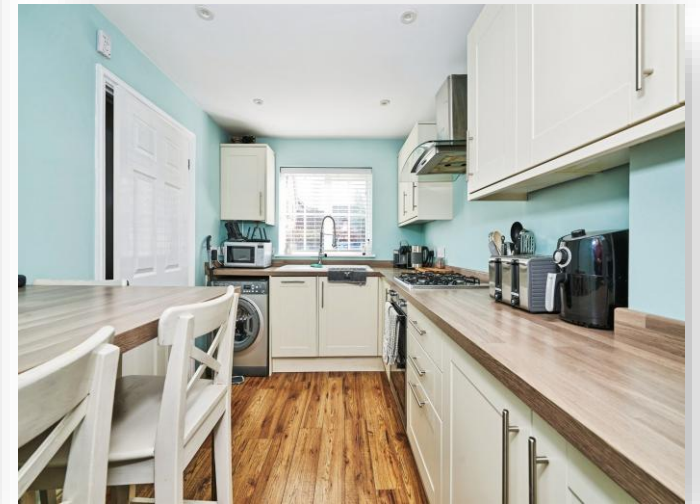
Baird Close, Yaxley Peterborough PE7 3GB