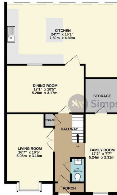
GROUND FLOOR 987 sq.ft. (91.7 sq.m.) approx.