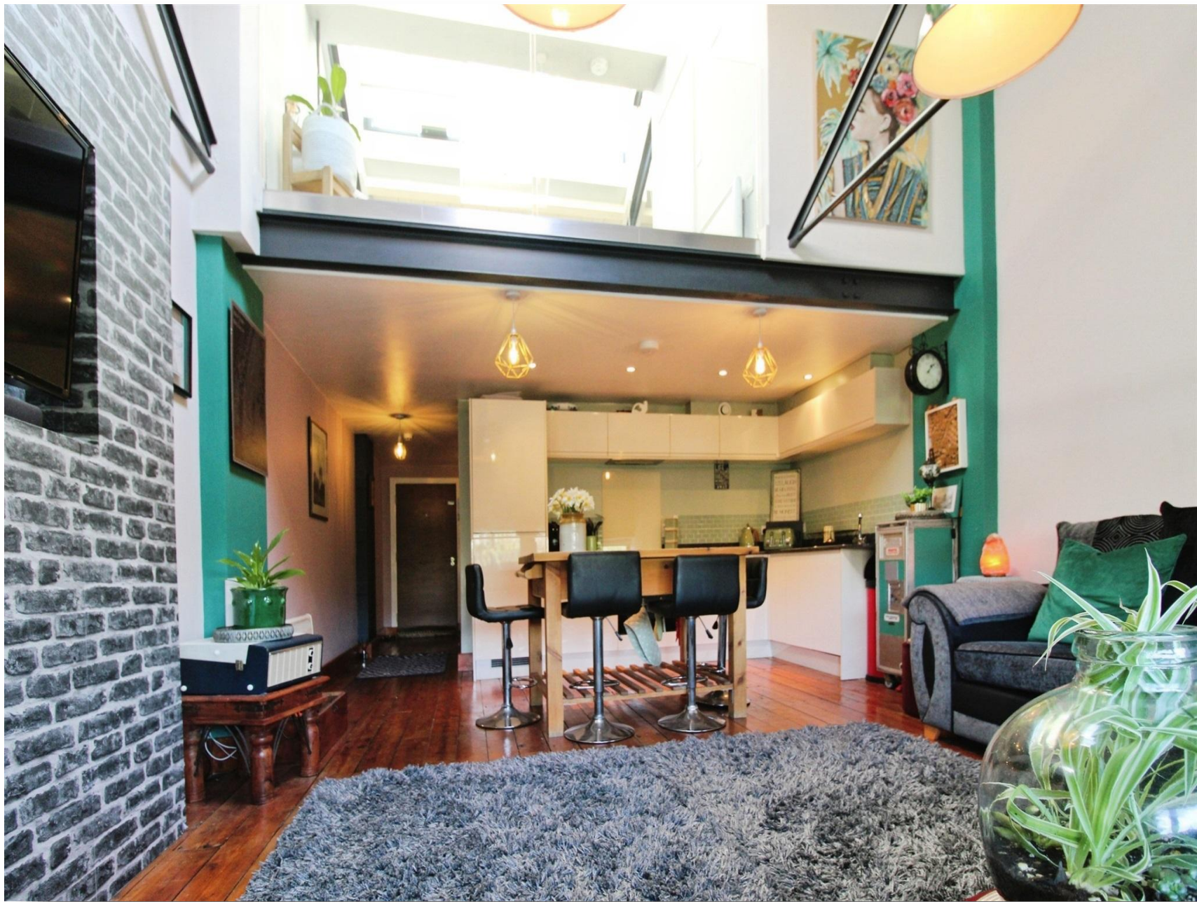
The Pumphouse Hood Road, Barry CF62 5BE