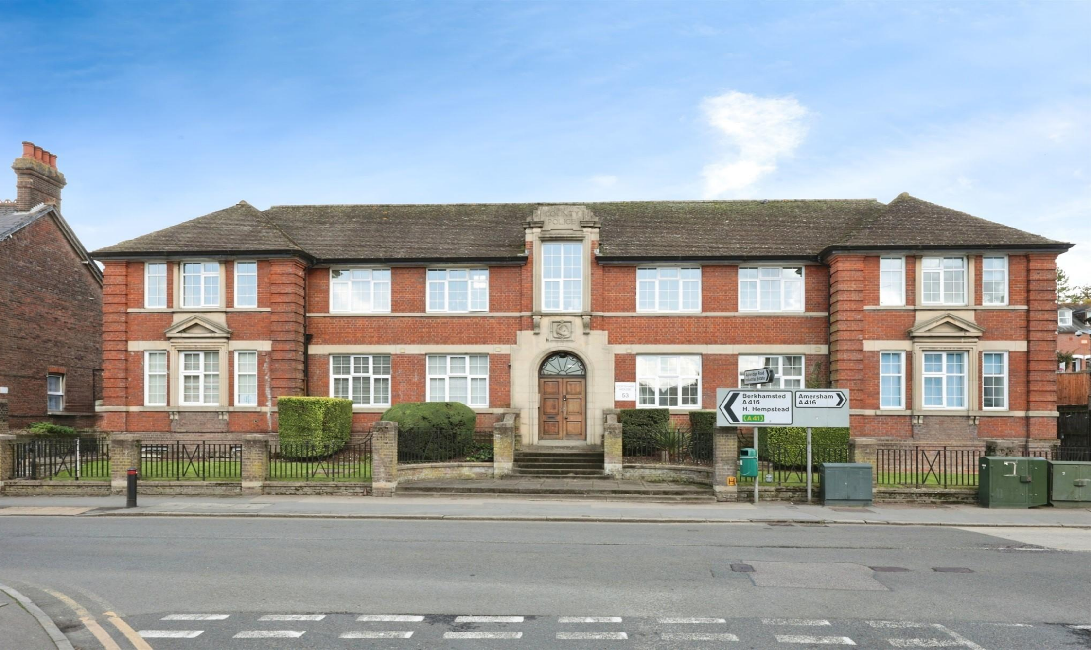
Copsham House Broad Street, Chesham HP5 3EA