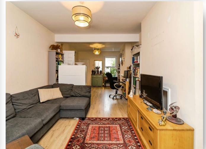
Salisbury Road, Lowestoft NR33 0HE