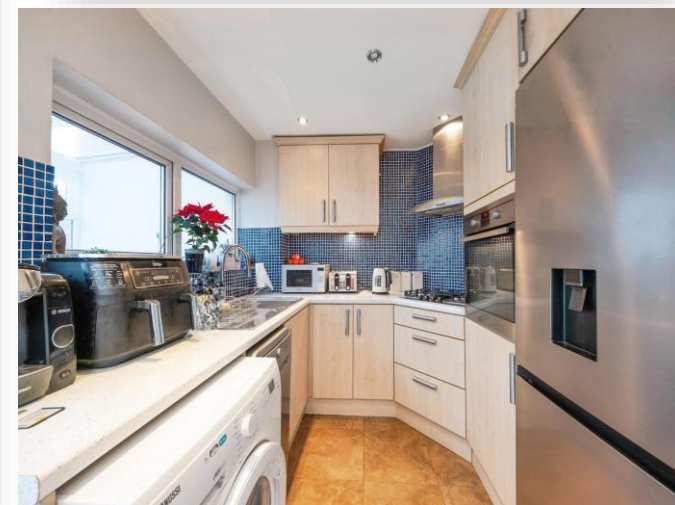
Bideford Green, Linslade, Leighton Buzzard, LU7 2TJ