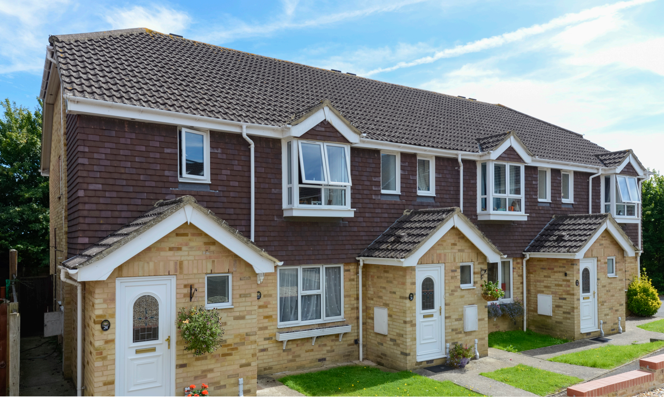
Highridge Close Maidstone | Kent