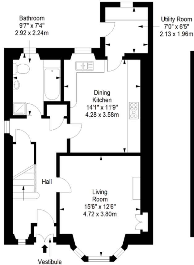
Ground Floor Approx. 57.6 sq. metres (620.0 sq. feet)