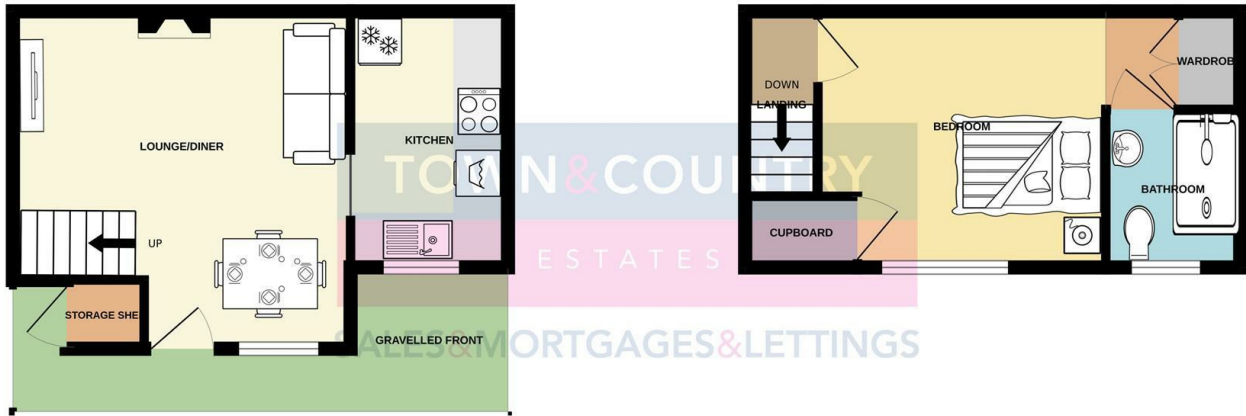
1ST FLOOR 218 sq.ft. (20.3 sq.m.) approx.

TOTAL FLOOR AREA : 475 sq.ft. (44.1 sq.m.) approx.