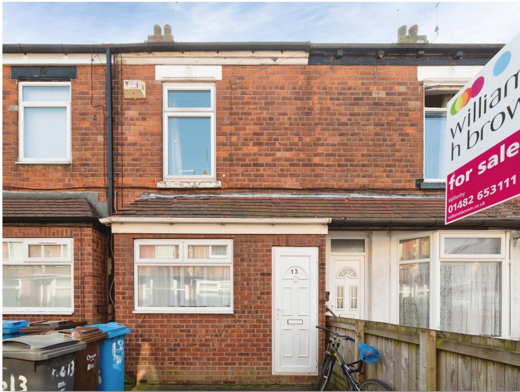
Marlborough Avenue, Hull HU4 6QD